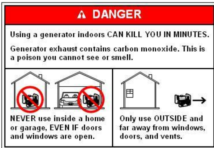
Table from Consumer Product Safety Commission

* Provide adequate ventilation and air cooling for the generator to prevent overheating and the accumulation of toxic exhaust fumes. Do not install your generator in a basement or any closed area. Exhaust gases contain carbon monoxide, which is an odorless, invisible, poisonous gas.